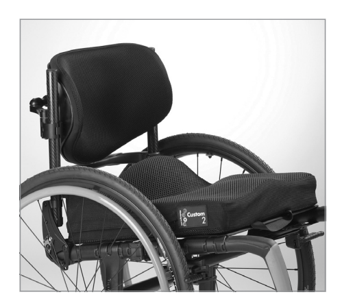
Ride Custom Backs paired with the Ride Custom Cushion 2 (above and below).